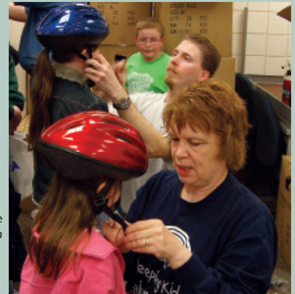
400 free bike safety helmets were fitted and given away at the Boone County Health and Safety Fair in March