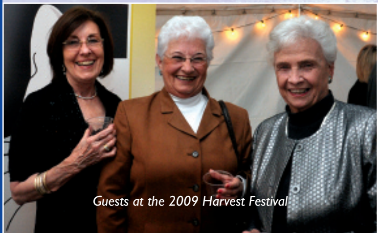
Guests at the 2009 Harvest Festival

By 2014, the Federal Government will require all hospitals to implement an Electronic Medical Record (EMR). An EMR will provide the opportunity for the health care provider to access your personal health records whether you are close or far from home. An EMR is currently the priority of Boone County Hospital. With assistance from donors, the Foundation can help make it a reality.